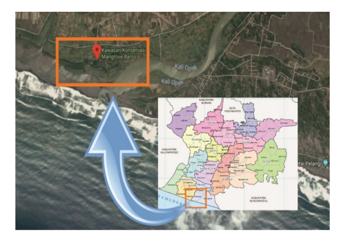
Fig. 1. Map of Mangrove Baros Forest Area

This research was conducted in Baros mangrove forest area, Tirtohargo village, Kretek subdistrict, Bantul district located at 110 \circ 17 '9199 "BT and 8 \circ 0 ' 48.066" LS. The location of this study was chosen because it is the only mangrove forest in Bantul district and is one of the icons of tourism and conservation. The location of the research can be seen in Figure 1.