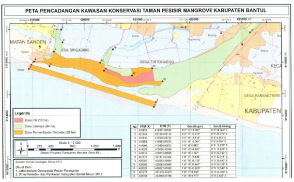
Fig. 3. Map of reserve area of conservation of mangrove coastal park Bantul Regency