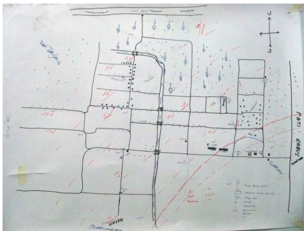
Fig. 3. Map of Flood Directions by Babalan village people