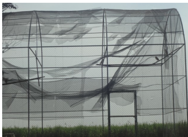
Fig. 2. Captive breeding of Tyto Alba in Babalan Village, Pati, Central Java