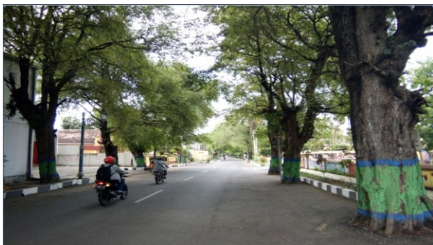
Fig. 2. The Javanese Tamarind plant head covering the area of the road