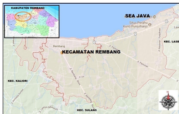
Fig. 1. Rembang District Map

Based on data from the Regional Government of Rembang Regency, the area of Rembang District 5,881 Ha with District road length of 77.9 Km.