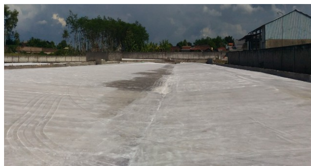
Fig. 4. Condition of the floor after drying process.

After drying process finished and tapioca starch moved to milling and packaging room, there were still founded tapioca starch left on the drying floor. This thing happened because of lack of employee's awareness about production efficiency and waste prevention. Tapioca starch that left behind should be can still continue to next process and increasing the number of final product. Good housekeeping alternative that can be suggested is to increasing employee's knowledge so can raise awareness to not leaving material that can still continue to next process.