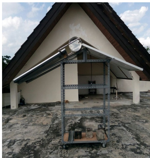
Fig.3. Solar water heating system position when was being tested

Solar water heating system fixed to the roof of the building where the sun heat can absorbed optimally as shows at Fig 3 . The sun shines unstable for each day and therefore reduces temperature of water in tubes.