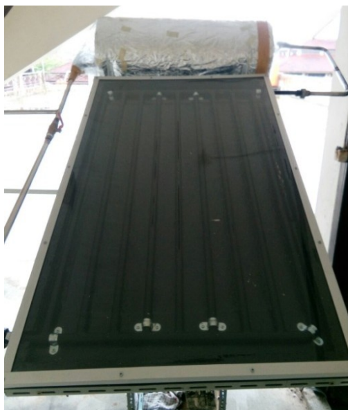
Fig.2. Solar water heating system for biodiesel production

Hot water will be up stream into storage tank because of different density between hot and cool water. As the sun shines on the collector, the water inside the collector flow tubes is heated. As it heats, this water expands slightly and becomes lighter than cold water. Gravity then pulls heavier, cold water down from the tank and into the collector inlet. The cold water pushes the heated water through the collector outlet and the top of the tank, thus heating the water in the tank [4]. Acrylic glass is using because can trapped sun radiation inside the box as the solar water heater is able to provide the hot water even in cloudy days [5].