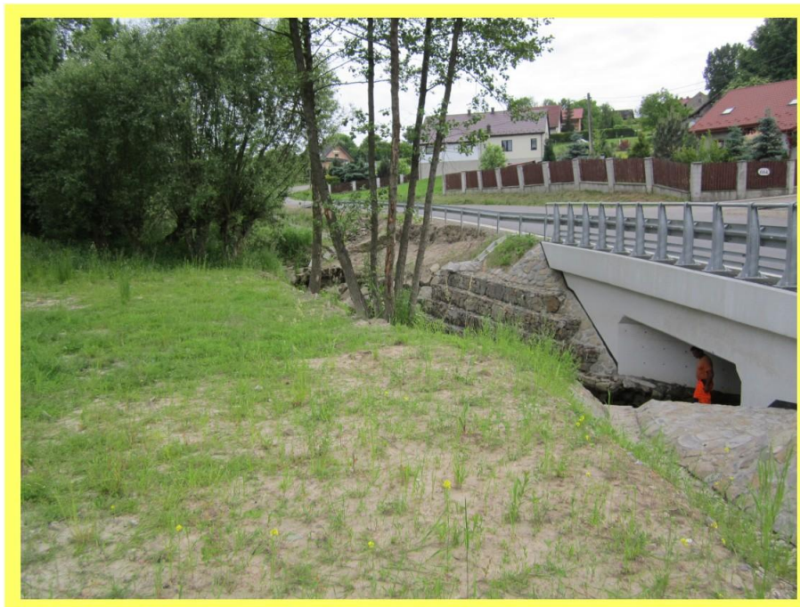
Fig. 3. Culvert on the upstream side and the view of damages