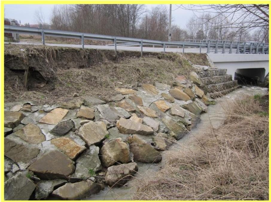
Fig. 5 The view of damages that occurred after the second year of exploitation from the upstream side

In the following year (2016) the improved protection was also gradually destroyed. Progressive failure of the bank is presented in fig. below.