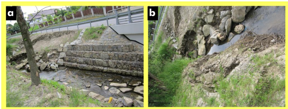
Fig. 4. The view of damages that occurred after the first year of exploitation a) from the downstream side and b) upstream side

In the first year (2015) after the construction was finished the bank protection on the right side formed from riprap slid along with the soil from the slope fig. below.