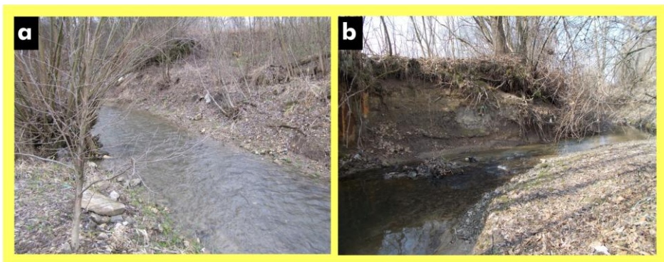
Fig. 1. Natural bed of the Wilga River a) upstream and b) downstream from the culvert.

The source of the Wilga River is located in Pawlikowice (Wielicki Foothills). The river starts at the altitude of 370 m above sea level and after about 21 km it flows into the Vistula River at the altitude of 200 m above sea level. The beginning of the river meanders through stone formations and after that it flows only through finegrained cohesive soils (Fig. 1a). The outlet stretch was regulated and embankments were built so the urban area is protected against the backwater from the Vistula River. The Wilga River has an irregular flow. During floods it rises, the flow velocity increases and the river intensely erodes its bed creating often vertical slops that are 3 m high (Fig. 1b). When the water levels are low they do not exceed a few centimetres.