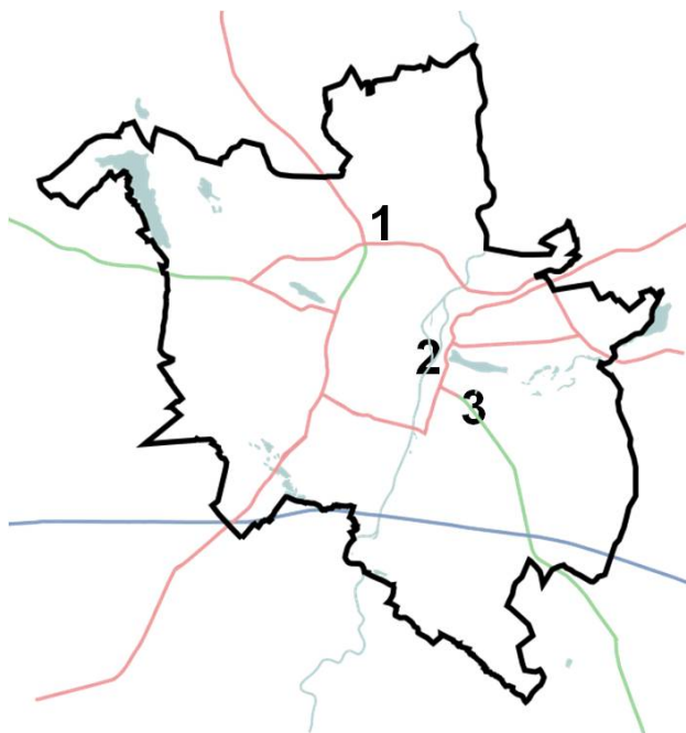
Fig. 1. Locations of measurement points in Poznań: 1 – Szymanowskiego Street, 2 – Jana Pawła II Street, 3 – Polanka Street

Assumed statistical significance was equal to 0.05, and the number of measurement samples in both cases was equal to 28. Interdependence between concentrations of particulate matter and meteorological conditions was presented with usage of a correlation matrix.