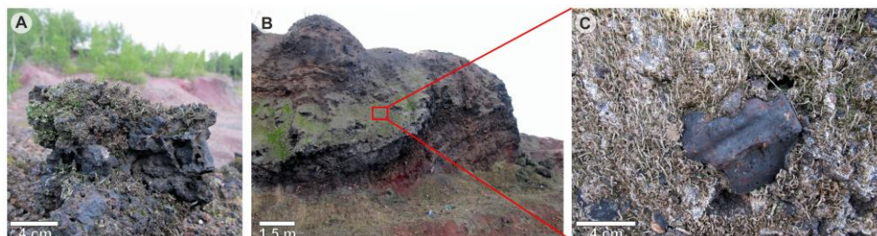
Fig. 1. Post-industrial wastes with associated lichens. A – solid sinter slag overgrown by the most resistant lichens; B – initial stage of succession of post-smelting dump with lichens as the first colonisers; C – dense sward of lichen assemblage covering slag substrate.

Lichens (lichenized fungi) constitute a symbiotic association composed of two units, a lichen-forming fungus (mycobiont) and an alga and/or a cyanobacterium (photobiont), forming a combined organism. Compared with autonomic fungi, lichens have many peculiar features, of which the most important are distinct and highly variable morphology and anatomy, specific metabolic pathways, and exclusive methods of reproduction. Lichens occur at all latitudes and grow on almost any type of substrate. The structure and physiology of lichens decide their success in the colonisation of environments extremely hostile to life [4]. Lichens have been defined as stress tolerators [5] and they are effective and rapid colonisers of bare ground [6] Their pioneer nature is associated not only with natural sites characterised by harsh climate conditions, but also with anthropogenic and strongly affected habitats. There are various adaptation mechanisms facilitating successful colonisation of such areas (see e.g. [7]). Some epigeic lichens with modest ecological requirements are known to be the first and most important colonisers of contaminated substrates [8-11] (Fig. 1).