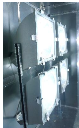
Fig. 1. a) view of the thermal chamber; b) view of the solar simulator.