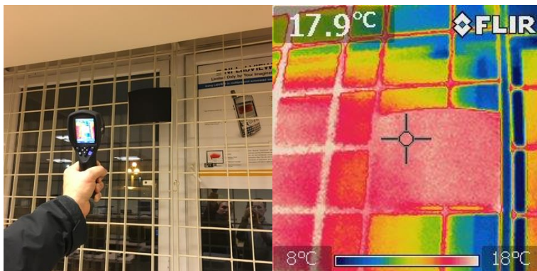
Fig. 1. Temperature measurements near cold source (window).

thermal comfort calculation. The procedure is based on measurement of matte black sheet of paper. The tests were performed at a height with range from 1 to 2 meters in three different points in the room: 1 – on black matte sample sheet of paper, 2 – on the cooling/heating source, 3 – on the adjacent surface. The objective of these tests was to verify the possibility of performing measurements in changing surroundings conditions (flow of cold or hot air) as shown on Fig. 1. For further tests a procedure based on matt black sheet of paper was used. Which is sensitive to the temperature changes in the measured environment.