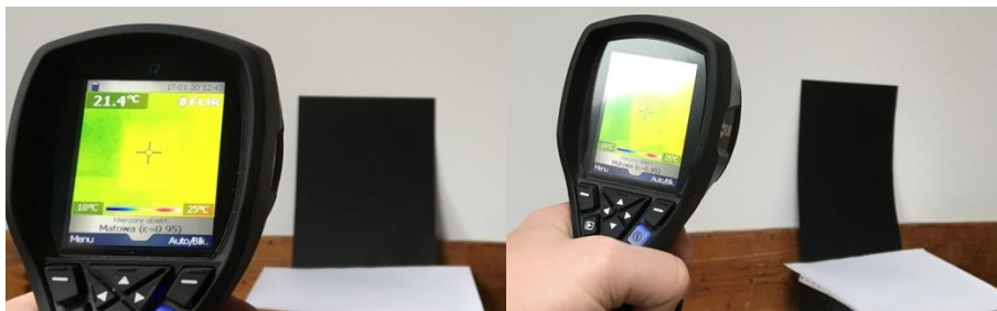
Fig. 2. Experiment no. 1 (left) and 4 (right), thermal imaging position and matte black sheet of paper.

The second test was performed in order to estimate the temperature differences observed on a single measuring black matte sheet of paper, depending on which one out of five points was the lens aimed. Fig. 3 depicts the distribution of considered points whereas Table 2 summarizes the results.