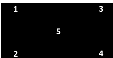
Fig. 3. Location of measuring point during the second part of the experiment.

The second test was performed in order to estimate the temperature differences observed on a single measuring black matte sheet of paper, depending on which one out of five points was the lens aimed. Fig. 3 depicts the distribution of considered points whereas Table 2 summarizes the results.