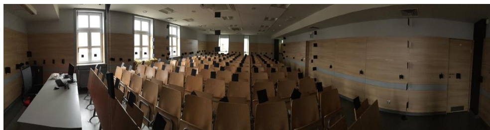
Fig. 4. Lecturing hall where measurements by means of thermal imaging and matte black sheet of paper were performed.

All measurements were performed in a lecture hall being a part of the Faculty of Management at the AGH University in Kraków. During measurement the room was not occupied by students and therefore it was possible to simulate the impact of various thermal conditions on the temperature distribution (severe draughts during winter, overheating etc.). The room is controlled by the Building Managements System (BMS). BMS controls a set of convection radiators with electric valves and fan coil unit connected to the building air handling unit installation. In the considered lecturing hall all inlets were located along the northern wall of the room, while outlets are located along the southern one. During measurements the ventilation was operating at its 20% of capacity (about 200 m 3 /h) whereas the volume of the lecturing hall is close to 300 m 3 . The lecturing hall is presented on the Fig.4 in panoramic image.