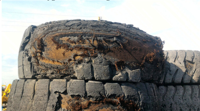
Fig. 1. The tires failed as a result of thermal destructions

As the main materials and adhesives used for production of tires are sensitive to high temperatures, OTR tire life substantially depends on its thermal condition. Quite often the generation of temperatures in OTR tires used on dump trucks reaches the maximum, that is caused by their low cooling rate. The reason of it is the feature of tire design that has big thickness. Especially it is easy to see in summer, when the average level of OTP tire life considerably decreases because of the tires which failed as a result of thermal destructions (up to 70% of all failures). When the internal temperature of a tire reaches extreme values (110° C), the emergence of the phenomenon of rubber pyrolysis is probable, that leads to release of combustion gases (methane, hydrogen), sharp increase in internal pressure in the tire which in the presence of oxygen can lead to ignition and blow-out of the tire.