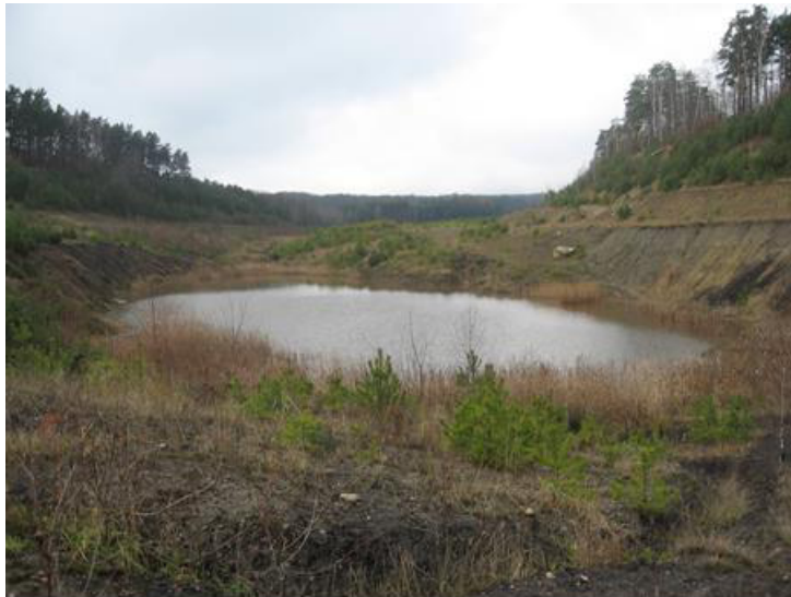
Fig. 2. The anthropogenic reservoir created in a pit of a former open cast mine – saddle No. VI; photo by G. Galiniak.

Additionally, small water reservoirs with defined morphology were created in the final lignite pits and in the specially formed troughs without run-off located in the reclaimed areas thanks to the inflow of groundwater and precipitation of water, leading to an increase in the habitat’s attractiveness (Fig. 2). Simultaneously, in the areas of troughs above the underground cavings, isolated marshes reaching area of 0.78 ha (Jeziro Ciche) were formed (Fig. 3) as a result of ground subsidence below the shallow groundwater level.