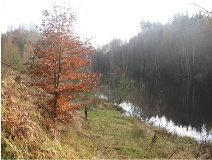
Fig. 3. The anthropogenic reservoir (“The Silent Lake”) in a sink-hole created as a result of underground exploitation - saddle No. VII; photo by G. Galiniak.

When analyzing the effects of previously conducted reclamation works, a preliminary analysis, based on a limited range of physical and chemical parameters, of the chemical composition of water from the reservoirs created in the post-mining terrains, was performed. In total, water from eight different reservoirs, representing the previously-mentioned types, was analyzed (Fig. 4). The samples were equally split between the classes. In the case of two biggest ones, with depths, determined by probing, exceeding 5.0 and 7.5 meters, multiple sampling was used as three samples were collected: from the bottom, middle, and near-surface zones. For the sake of comparison, an additional sample was collected from a well drilled for mine supply, filtered within the Quaternary aquifer (Fig. 4).