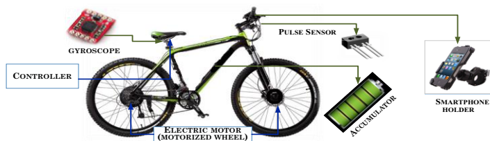
Fig. 2. The elements that are included in the developed module.

Electric bicycles are controlled by bicycle computer (controller), which is supposed to: supply amperage from the battery to the electric motor in accordance with the user's settings; show residual battery charge on the indicator; determine the rotation / stop of pedals; limit the maximum speed of the bicycle movement in order to save energy; keep constant speed (cruise control); charge the battery while braking. At the same time there is a variety of stationary bicycles that are belong to the group of cardiovascular machines which are equipped to control the physical condition of a user. At the same time the main indicator to diagnose critical state is a pulse rate. If to equip the bicycle with the universal module, which includes a pulse sensor, a controller and other components that are shown in Figure 2, and to manage it in accordance with the selected program installed on smartphone it will help to increase the attractiveness of cycling among untrained population. Application of the developed module will enhance the attractiveness of the bicycle due to the fact that owners of such vehicles may have insufficient training and at the same time the overload risk will reduce.